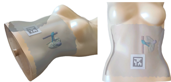
(a) View from the side